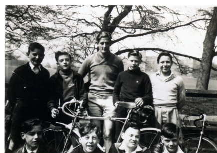
Members of the Cycling Tour 1951