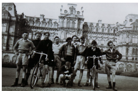
Outside of Bowes Museum