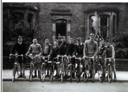
Cycling Club at Barnard Castle Youth Hostel