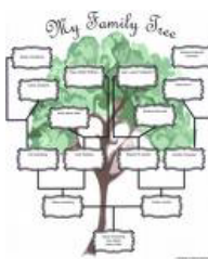
This is one way of presenting your tree