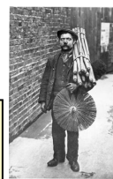
All Areas Covered

Domestic & Commercial Chimney Cleaning Gas, Electric & Solid Fuel Smoke Tests Blocked Flues Annual Contracts Fully Insured Service